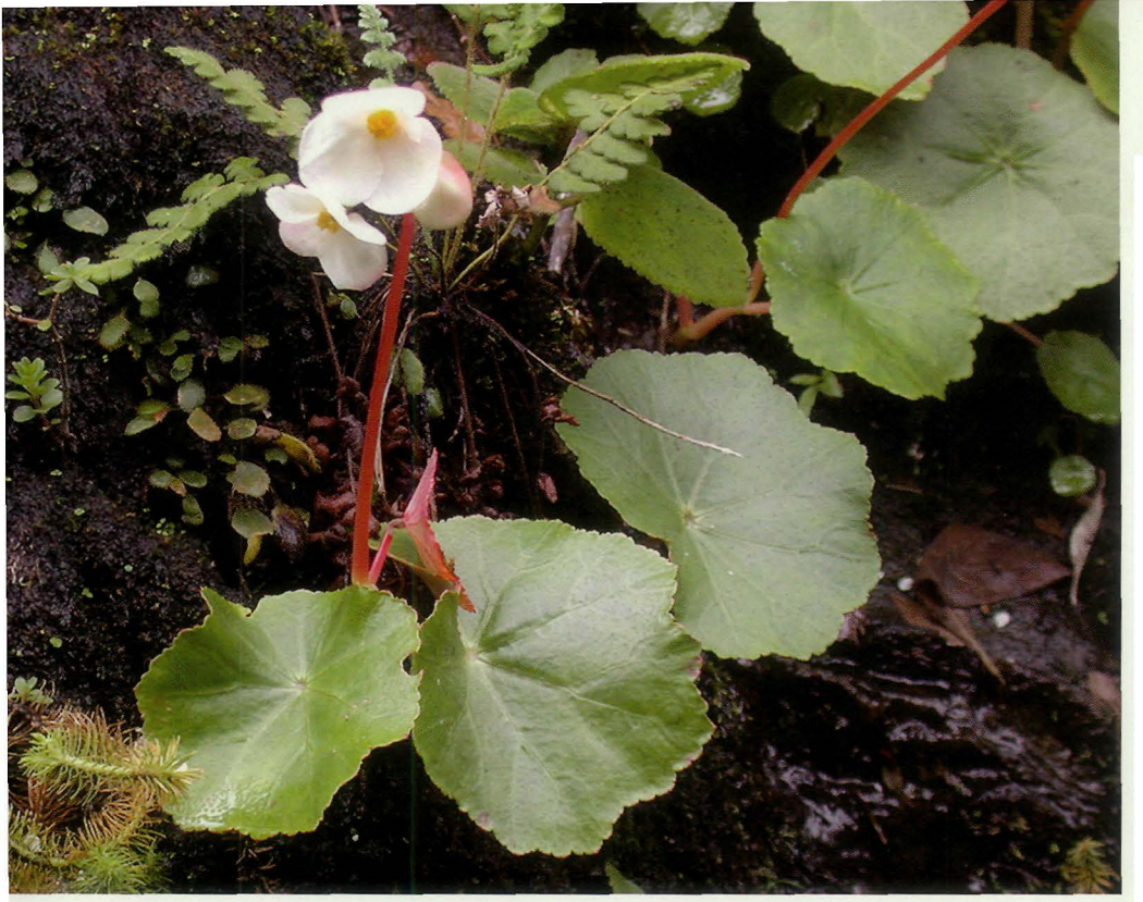
B. caparoensis

life by visiting Mauro's website, www. Brazilplants.com. The fact that Mauro is also a photographer certainly enhances his website. It is easy to navigate, truly informative, and features pictures and information on many families, including begonias.