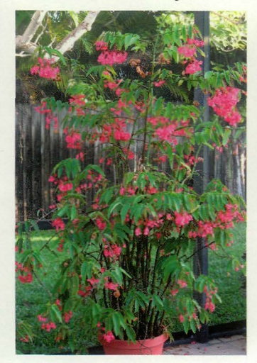
B. albo-picta 'Rosea' growing in pool area

After your cuttings have rooted, in 2-3 weeks, you may start fertilizing them. The only fertilizer we use is time-released Nutricote. which we buy wholesale in large bags. A similar product is Dynamite which is available in small containers at Home Depot. Now that your plant has rooted, it needs to be moved into more light. Our canes grow in all-day 50% shade in the pool screen area. Outdoors in morning or