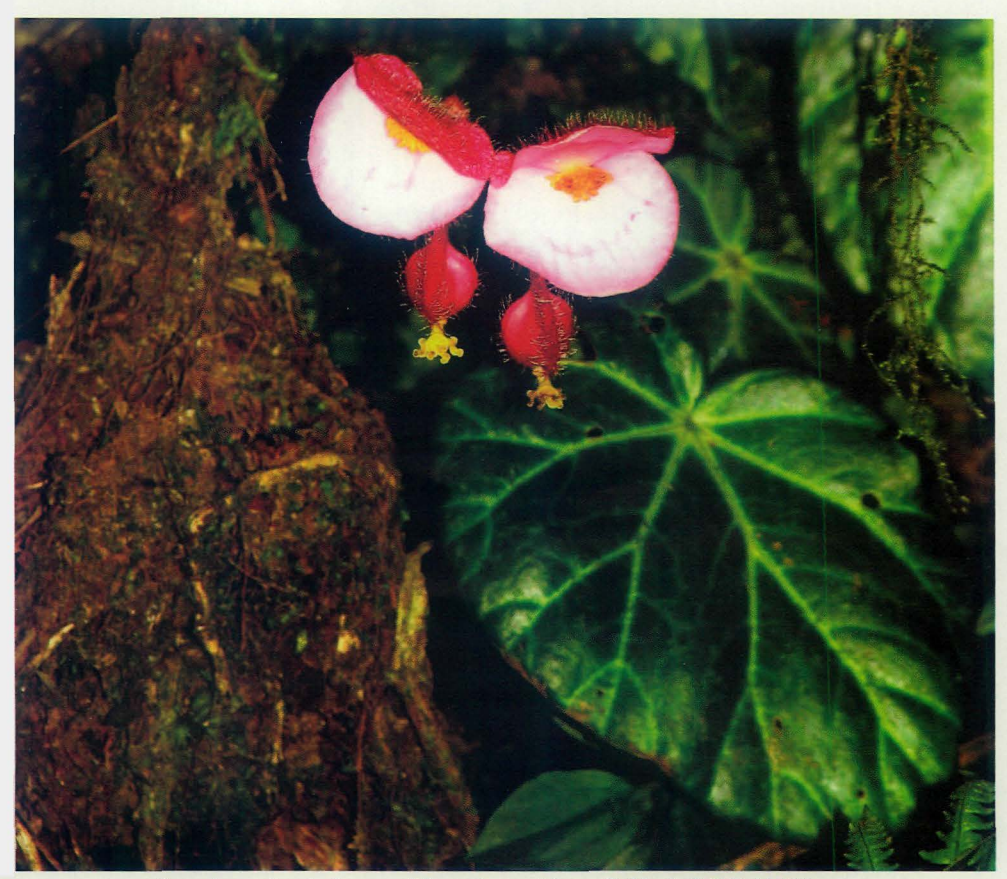
Capsules and male flowers of Begonia morrisiorum R. Morris & P. D. McMillan

RM 08-334 (CLEMS); RM 08-342 (CLEMS): Ixtlan