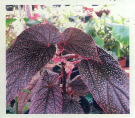
B. U062 seedling - A Begoniac Winter in Northern Louisianna pg. 108