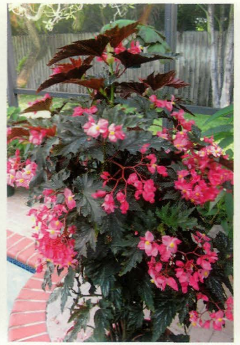
B. 'Lana' growing in pool area