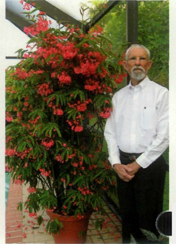
B. albo-picta 'Rosea', taller than Doug, growing in pool area