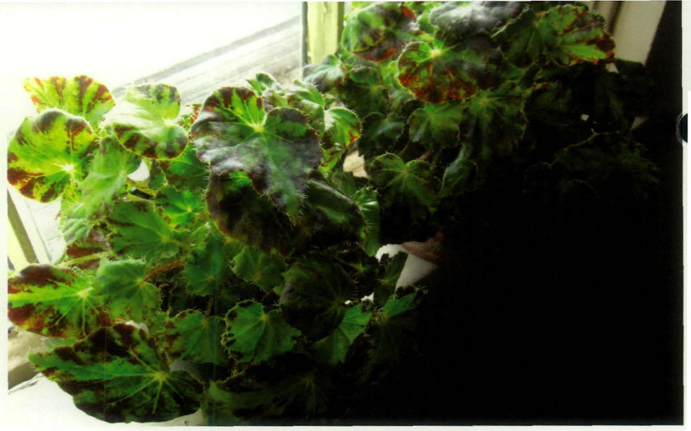
A group of B . 'China Doll' on a small windowsill.