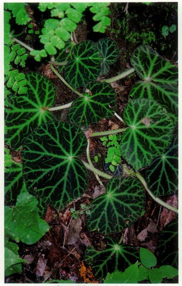
B. pseudodaedalea in situ