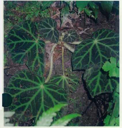
A new species, B. pseudodaedalea pg.88