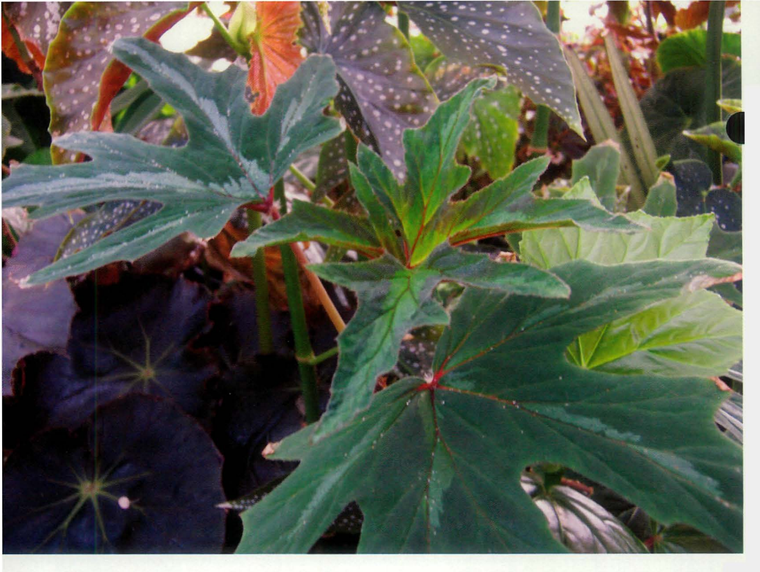
B. leathermaniae (above) The unique new leaves of this species play off B. 'Lulu Leonard' and B. 'Selph's Mahogany' Blooms of B. 'Kit-Kat' (below).