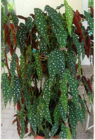
B. maculata var. wightii

We'll start with propagation. Take three 4-6-inch cuttings from a healthy cane begonia. Place them close together in a