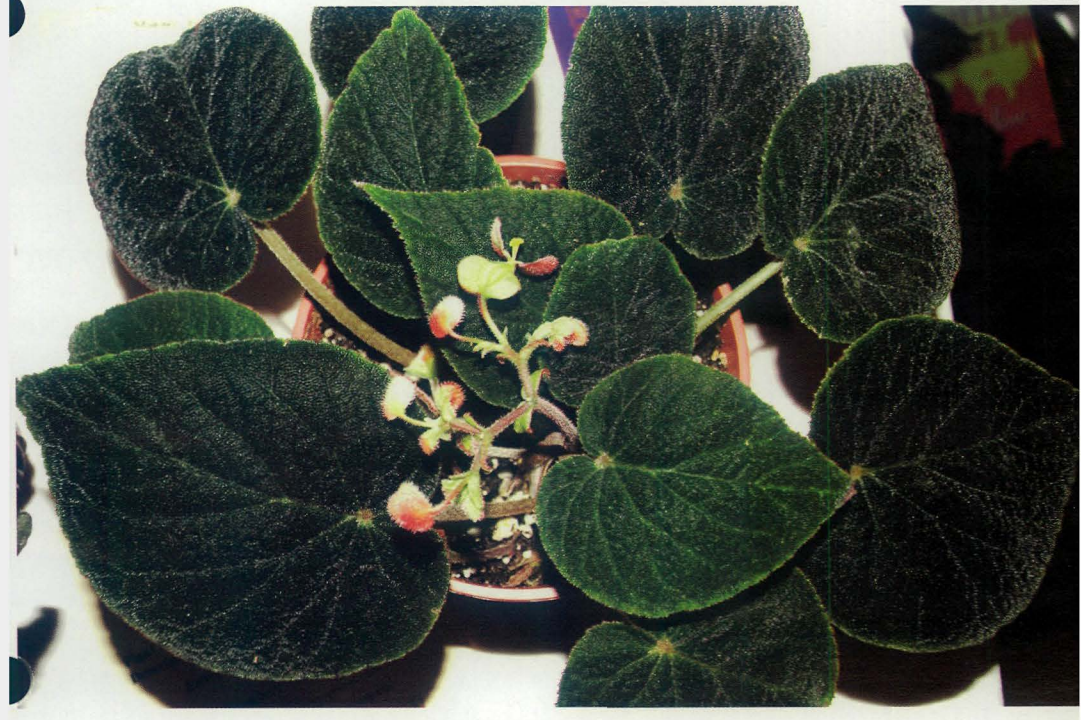
B. imperialis