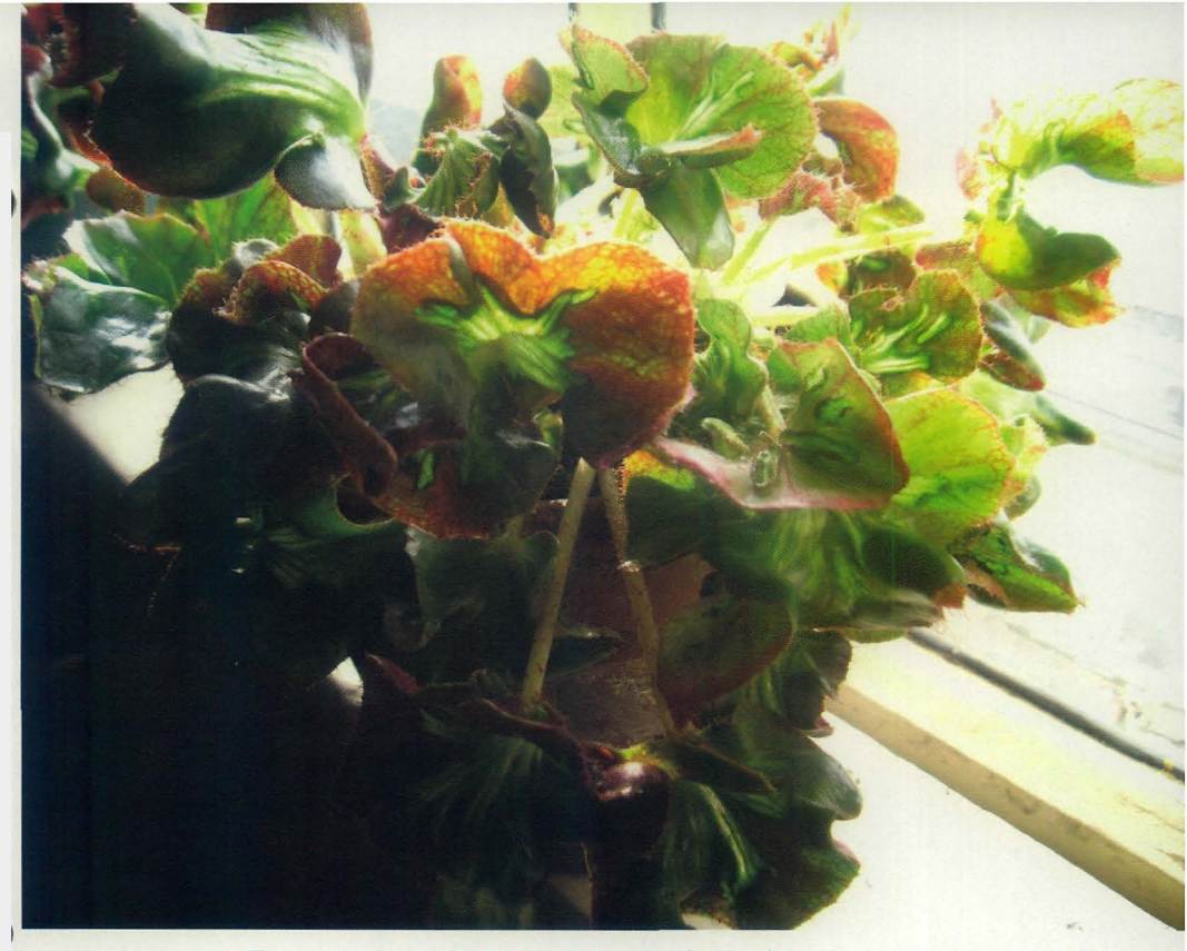
The ever-interesting B. 'Fiji Island'.

fondness for B . 'China Doll'. The leaves are bright green with varying degrees of dark reddish-brown splotches along its margins. All of the above are wonderful and have pink or white flowers in the spring!