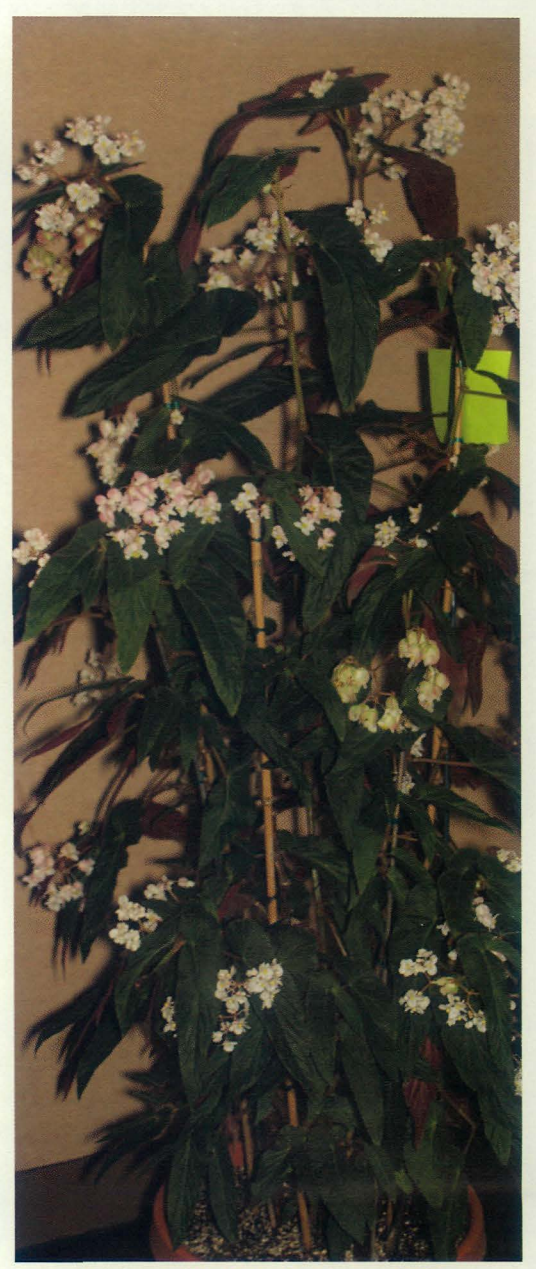
B. juliana in West Palm Beach show 2009

A few days before the show, scrub any dirty clay pots, clean the plastic ones, or transfer to new ones the same size. Do not repot to a larger size now. Remove any debris from top of soil and top dress with fresh soil. Remove old flowers and old or damaged leaves and rinse off your plants so they will be clean and shiny. We actually trim brown leaf edges, keeping the shape of the leaf correct. The day before the show, do any final grooming and remove the label.