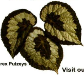
B. rex Putzeys

935 W. Isabella St. Lebanon, OR 97355 (541) 258-7517 goetzk@begonias.com