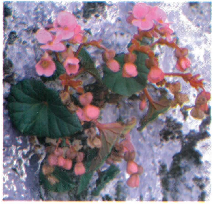
Above, B. samhaensis M. Hughes and A. G. Miller, in ed. The drooping flowers on this plant are pollinated females; the fruit is swelling behind. Male flowers with four tepals are visible at the top to the picture. Below, Dracaena cinnabari woodland at the foothills of the Haggier mountains on Socotra, where B. socotrana can be found. This impressive tree is one of the many unusual plants endemic to the island.