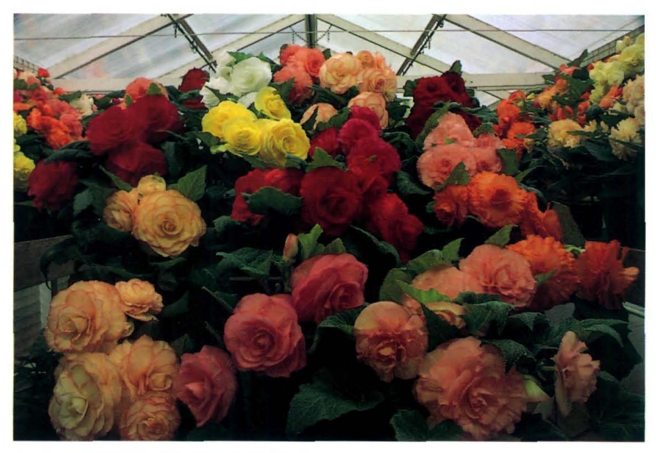
just a portion of the Neuman greenhouse