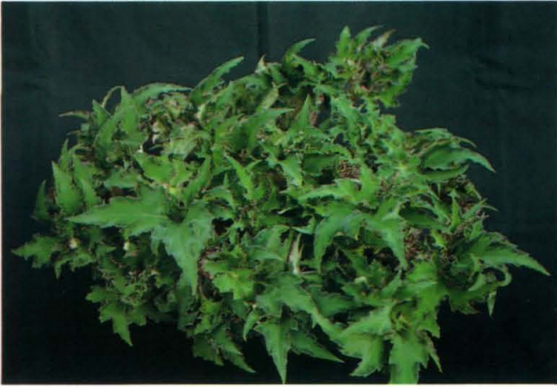
B. 'Shooting Star', Best New Introduction ABS Convention 1992 Anaheim, California.