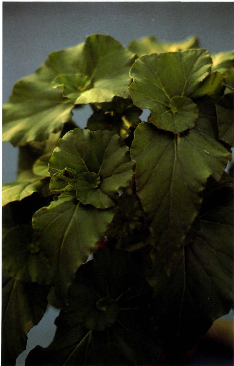
B. 'Kathlyn Calvert', a cane with a deep spiral.