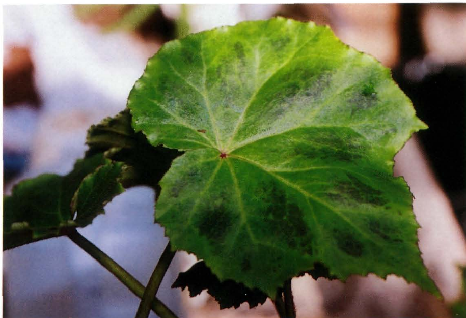
Leaf of B. plebeja var. plebeja