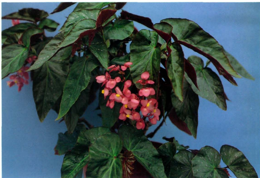
B. 'Sooner Gal'