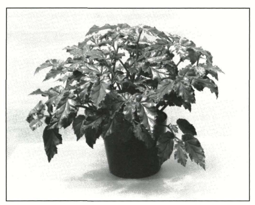
origin in the Cascades area of Panama.