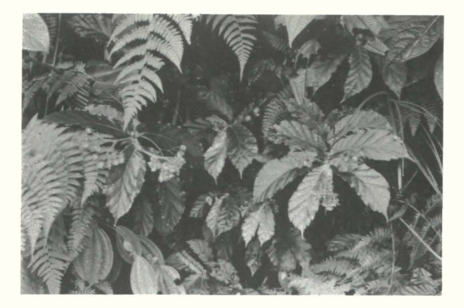
B. tonduzii at La Mesa, Panama

from West Africa have large seeds with a short viability period. Supply has been refrigerated for preservation.