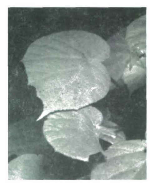
Close view of leaves of B. glandulifera See pages 110-111.

Please, robin members, remember your courtesy postcards to your chairmen. It saves expense, aggravation, and loss of letters.