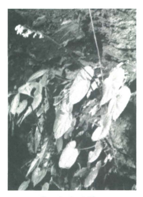
Begonia glandulifera In natural site near a stream bed

While searching for fish along a river one day towards the end of our last visit, we came across an unexpected Begonia . Unexpected, because we had already found all of the species recorded from the island. But there, growing in a shallow covering of moss over wet rocks along the river, were plants with the growth form and flowers of the genus. Since we have not yet been able to indentify this plant, it is currently being designated as B . U175. It is a small plant, with narrow, pointed