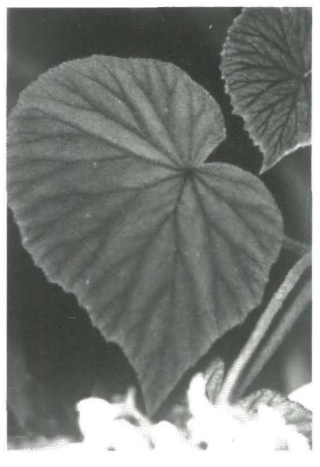
Unidentified thick-stemmed species Exhibitor, Edythe Ropiek