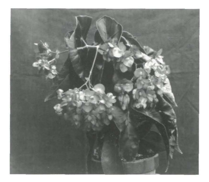
Begonia 'Yakagura', Reg. No. 888

wing leaf blades with red reverse are 7 7/8" to 8 1/4" long by 2<sup>3</sup>/4" to 3 1/4" wide, smooth and wavy with almost entire margin, 5 main veins, short petioles, and green stipules. Huge drooping clusters of large, brilliant orange-red flowers, with 4 tepals on both males and females, are borne on 2<sup>3</sup>/4" to 3 1/8" peduncles the year around. Originated in 1981 by Sadakichi Kawanami, 2612 Hajicho Sakai, Osakafu, Japan; first bloomed in 1981; first distributed in 1982; tested by Hikoichi Arakawa, Nishinomiya, Hyogo, Japan. Registered July 16, 1985.