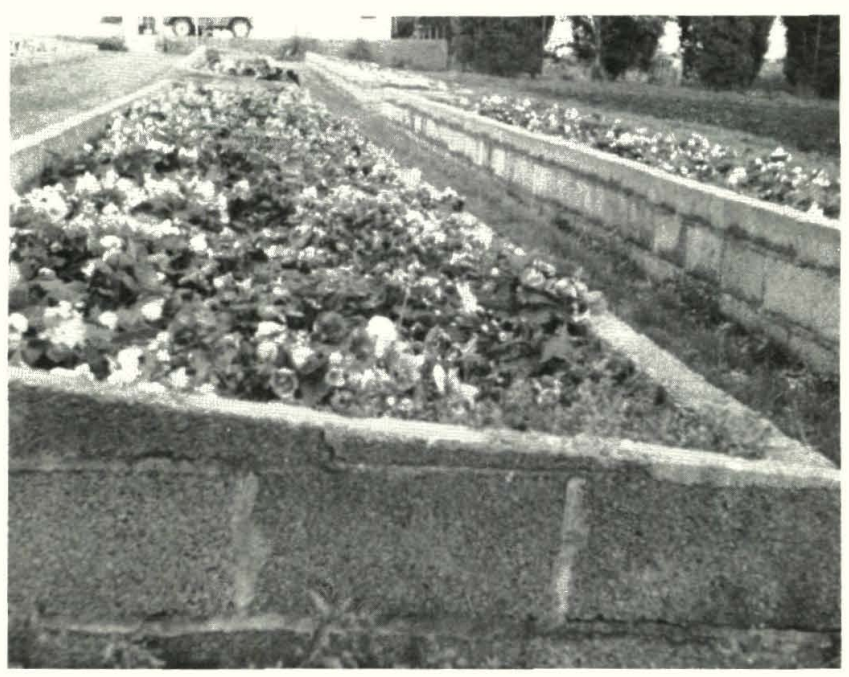
The indoor and outdoor growing beds of tuberhybrida cultivars at Blackmore and Langdon.