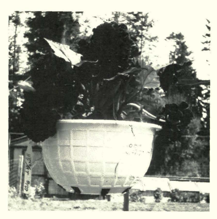
This brilliant red double flowered pendula type tuberhybrida is called B. 'Pom Pom.'

There is considerable variation in the growth rate of sprouted tubers. Some plants will be four inches high, ready for potting outside in beds long before others are ready. The rate of growth can be controlled by raising or lowering the temperature as mentioned above. The goal should be to have plants four or five inches high by the time that the nighttime temperature outdoors in consistently 55° or over.