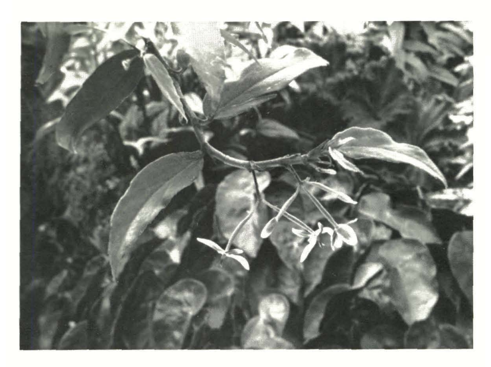
B. komoensis Irmscher

B. komoensis is a fascinating plant that grows handsomely in a hanging container. The stems tend to grow horizontally before they trail — the growth is sprawling.