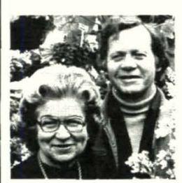
THE THOMPSON GREENHOUSE

Answer: B. U003 is now classified as shrub-like, low, compact. It actually has a stem, not a rhizome. It spreads, but does not grow upright at all. Mine is in a 14 inch shallow tub and is already going over the sides of the tub. It is very easy to grow if you can give it the conditions that it likes. It must have low light and high humidity to bring out the beautiful colors of the leaves. I grow mine in the greenhouse on the north bench where it gets additional shade from some larger plants. I'm sure you will enjoy it. There is no problem at all with staking or shaping. It just "does its thing" and makes a beautiful plant.