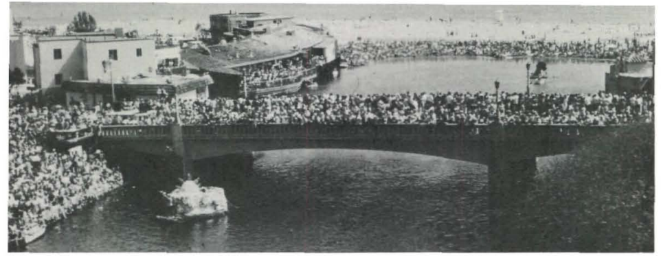
A bird's eye view for the intrepid few. . . . From atop a railroad bridge only the adventurous lare climb, the view toward the ocean (above) shows thousands attending the National Begonia Festival parade. They line the banks of Soquel Creek and the lagoon, they crowd onto a highway bridge, and they jam themselves onto a bar balcony. In the other direction, against a dense green backdrop (below), the begonia-covered floats prepare to parade lown the creek past the judges into the lagoon.