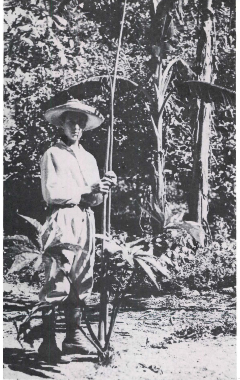
This photograph of the plant known until now as B. macdougallii was reproduced in the October 1948 Begonian. Taken in the wild, it purports to show a flower stem about 8½ feet tall. The correct name for this plant now is B. thiemei.