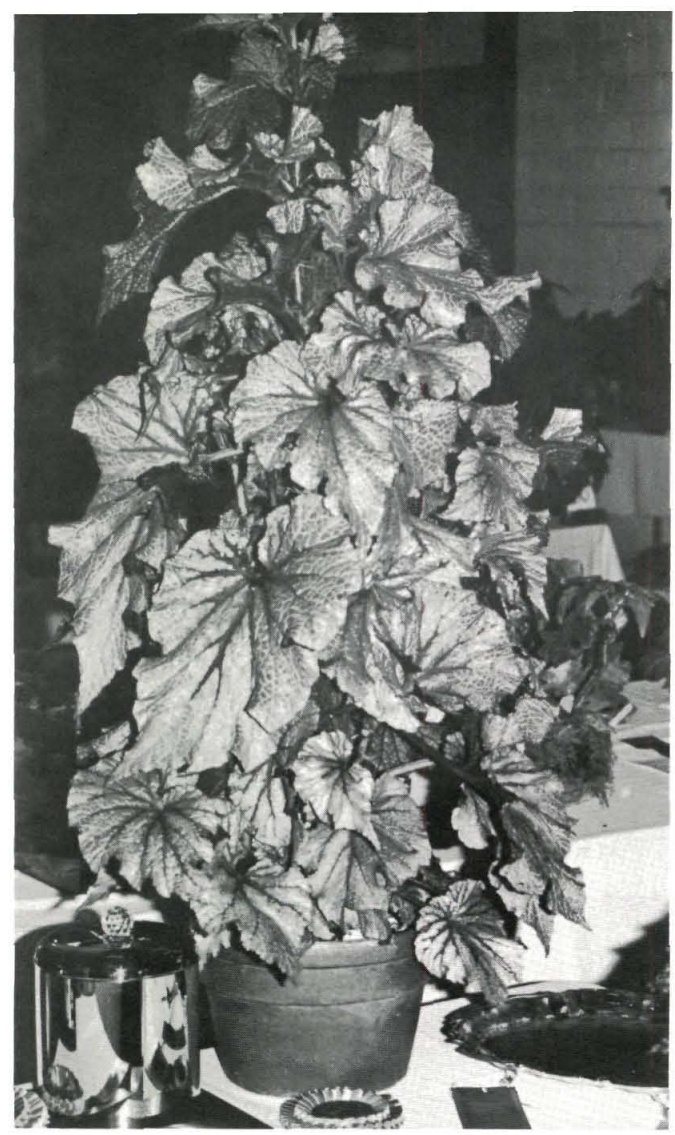
Alice and Isadore Gold grow B. 'Curly Silver Sweet' on a totem pole in their San Francisco garden. In addition to winning a silver tray as the Westchester Branch trophy for best novelgrown begonia, the Golds received a goldplated ice bucket for best plant in the golden anniversary show.

both surfaces of all leaves are sprayed with a hand mister until sopping wet. Then, gently supporting back of leaf in one hand, the upper surface is carefully wiped off, especially the tip, so the spray solution does not stain the leaf surface.