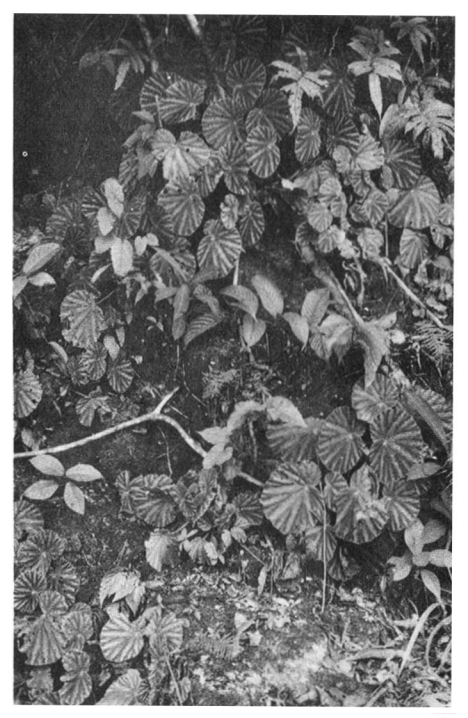
B. sharpeana, the Omati Begonia growing in Papua New Guinea

A few notes about the other plants in our key. Begonia acaulis (cover of the Begonian of August, 1973) is one of the prettiest begonias I know but very hard to grow. A few times