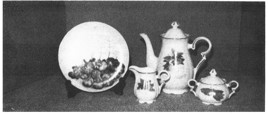
Begonia art winner - Tea set with B. 'Sachsen' as theme, plate with B. 'Erythrophylla' by Lis Schaefer.