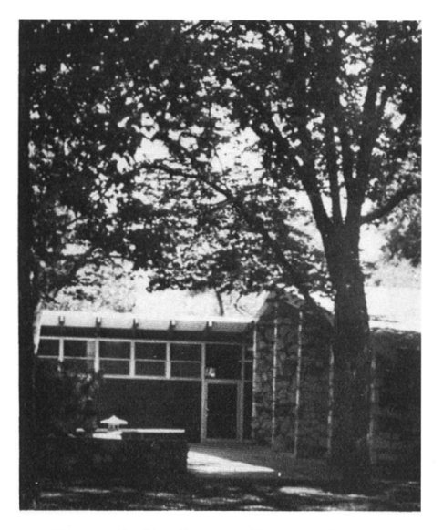
Shepard Garden and Arts Center

tion Department and was made possible by years of hard work and donations from the more than 40 groups, chiefly art and floral societies, which meet here monthly. All monies used for improvement and maintenance are the results of an annual white elephant sale held at the Cal-Expo each October. Only the salaries of the custodians are from the city budget. The next project is the addition of a wing with expanded kitchen facilities, which has been proposed to the City Council for several years and is not yet underway, but we do not give up easily when it comes to expanding this building so all can enjoy it.