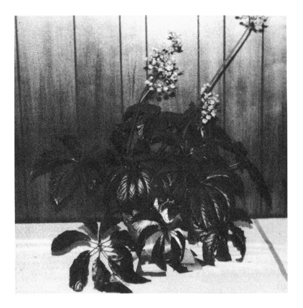
Best in Show Trophy Winner Begonia macdougallii var. brazil

ABS PERPETUAL TROPHY FOR SWEEPSTAKES Helene Jaros – 13 Blue Ribbons