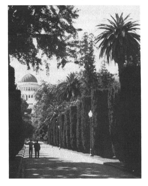
The Hall's Greenhouses

Cover Photo of the garden of Clarence and Tish Hall By Pam Mundell, Sacramento, Calif.