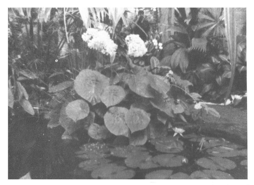
Two scenes from Fairchild Gardens, the upper showing Begonia popenoei and the lower showing Begonia mazae forma nigricans.