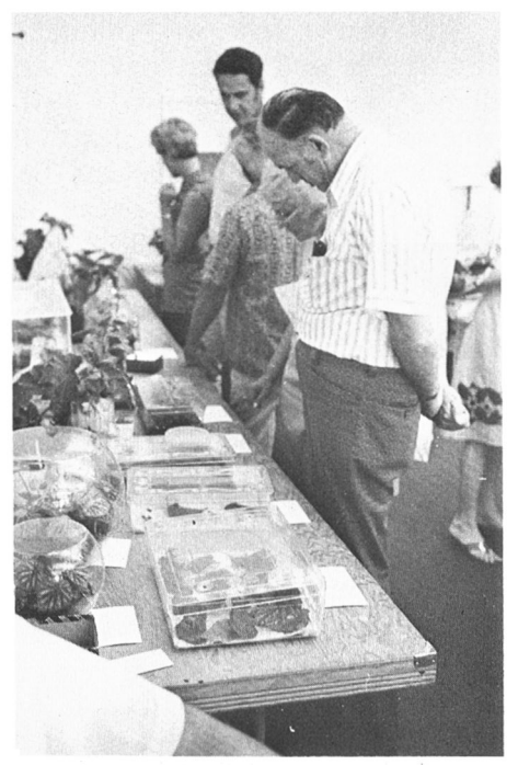
The Educational Display