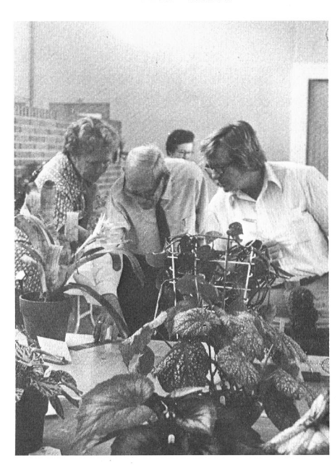
Some of the Plants on Exhibit