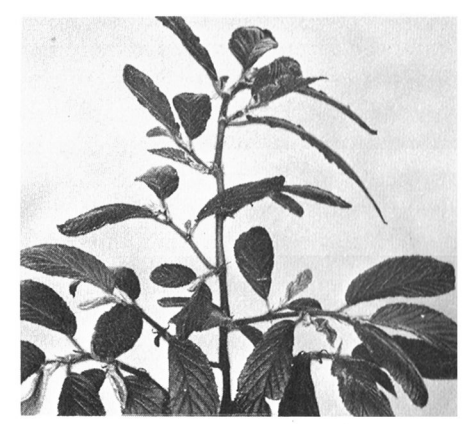
B. rufosericae toledo

Tall loosely branched, with pale green leaves and red-spotted stems;