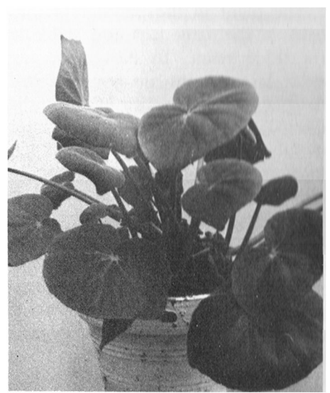
B. acetosa

This species must not be permitted to become bone or dust dry although it is best grown on the dry side particularly during the winter when it rests. Beginners should never err in the belief that "on the dry side" means keeping a begonia as dry as a cactus. Too little water is evidenced by drooping leaves, which