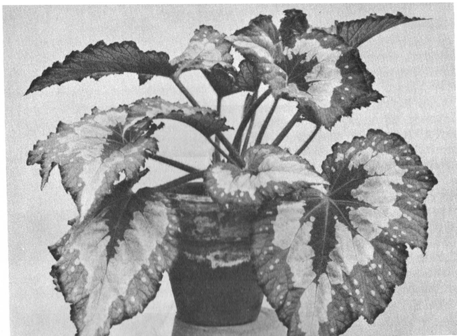
B. 'Merry Christmas'