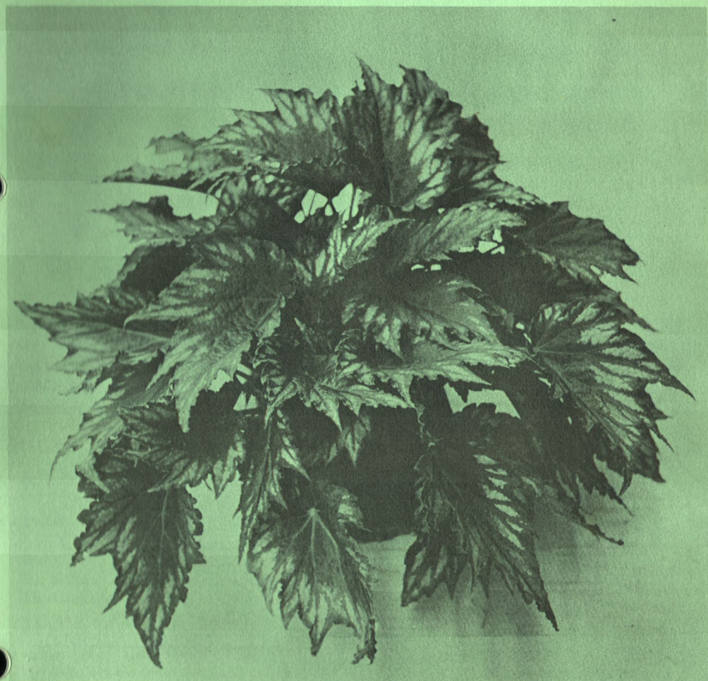
B. Rex 'Helen Teupel'