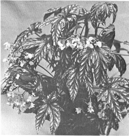
Begonia wollnyi Herzog