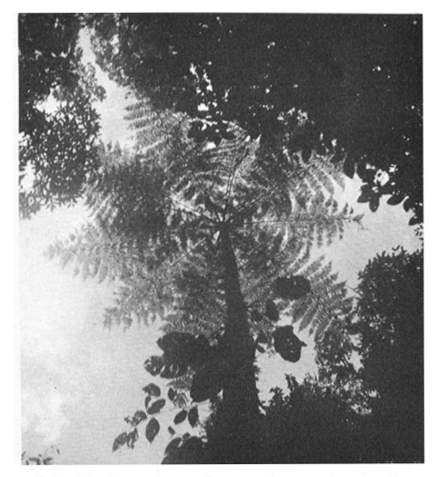
Tall Cyathea tree ferns give a lacy effect to the forest canopy.

Editor's Note: A botanical description of Begonia bettinae (Ziesenhenne) was published in the November, 1965,