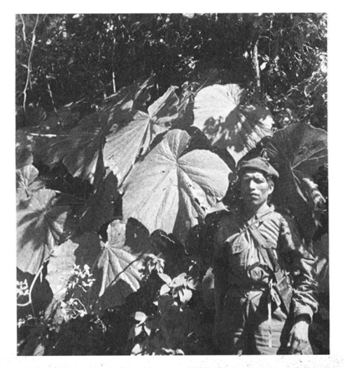
Identified as B. fusca, this is surely one of the giants of rhizomatous begonias. A leaf blade measured over 21/_2 feet and an inflorescence topped 61/_2 feet.

In the wild, B. lobulata is at its best in full sun, whereas B. Bettinae seems to prefer rather heavy shade.