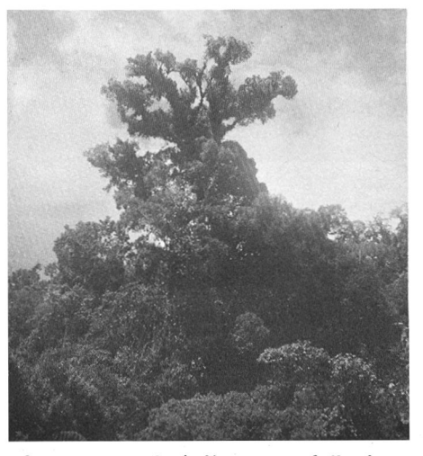
Quercus corrugata (oak) — one of the large trees of El Triunfo.

Editor's Note: A botanical description of Begonia bettinae (Ziesenhenne) was published in the November, 1965,