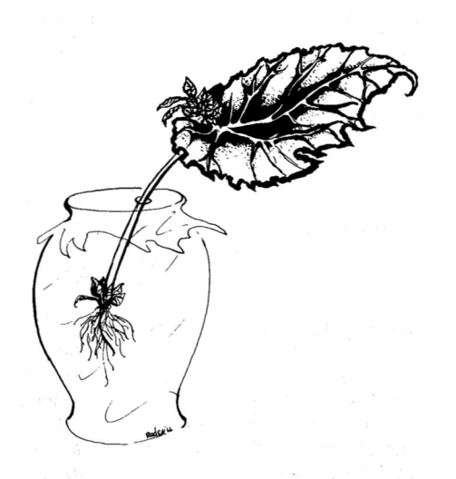
Rex leaf-stem cutting in water with plantlets at sinus and at base of stem

Some growers insert the stem or wedge into perlite, vermiculite, or sphagnum moss, or perhaps into a mixture of vermiculite, milled sphagnum, and a little soil. Some cover cuttings with plastic or use a plastic box; others do not. Humidity and temperature undoubtedly make a difference, and some begonias do need more humidity and warmth than others.