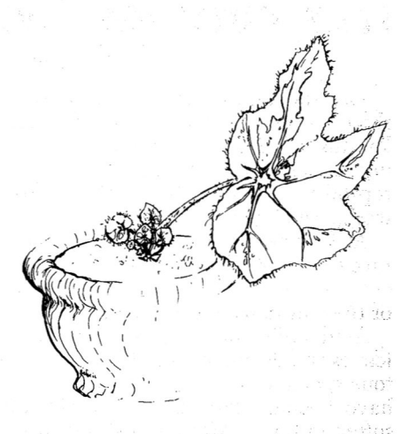
B. 'Bow Nigra' leaf-stem cutting in mix

Edna Stewart reports that even in warm weather cuttings root more readily for her on a heating cable. She divided and potted plantlets from a leaf of B. 'Kumwha' on the cable long before cuttings on the greenhouse bench showed progress. Robbie Totino uses a cake pan or pyrex dish set