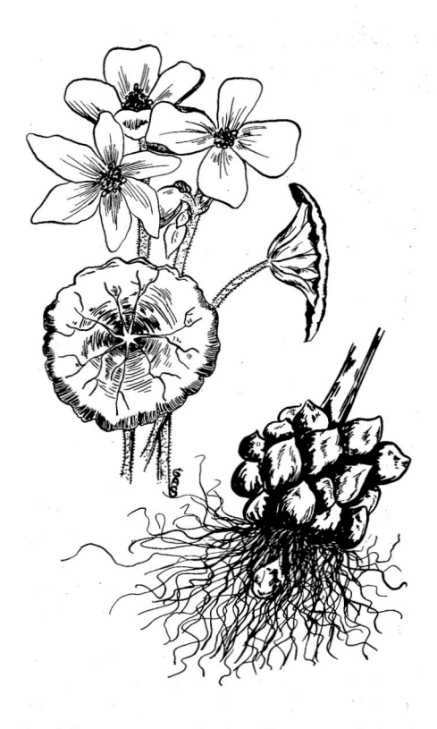
Begonia socotrana showing flowers and leaves with a detail of the bulbous rootstock.

B. dregei and named the resulting plant B. c. 'Gloire de Lorraine'.