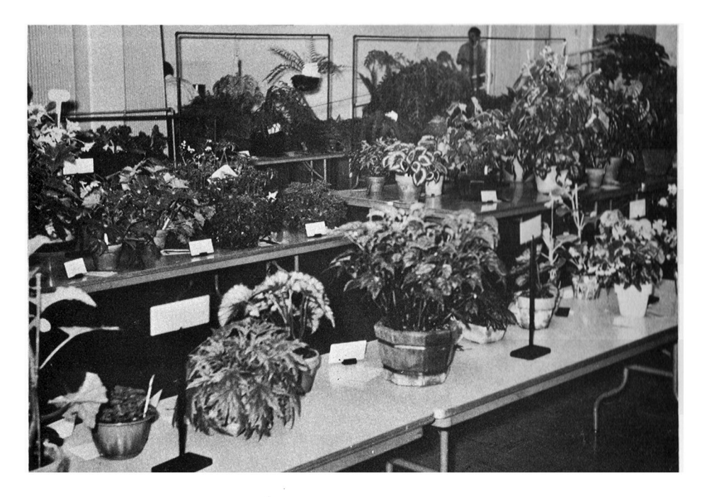
The 1964 Show