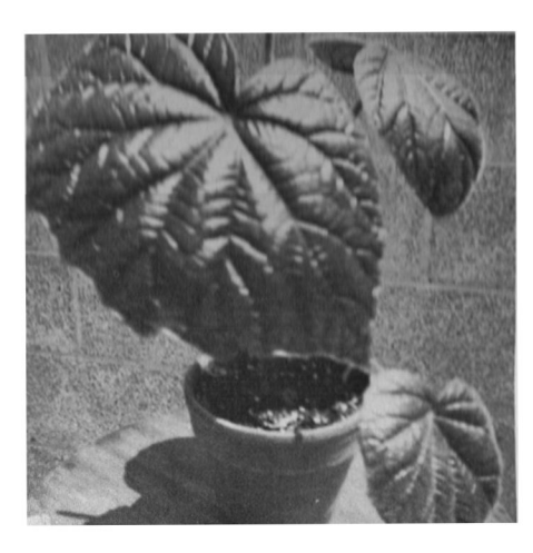
B. 'Rubud Giant'