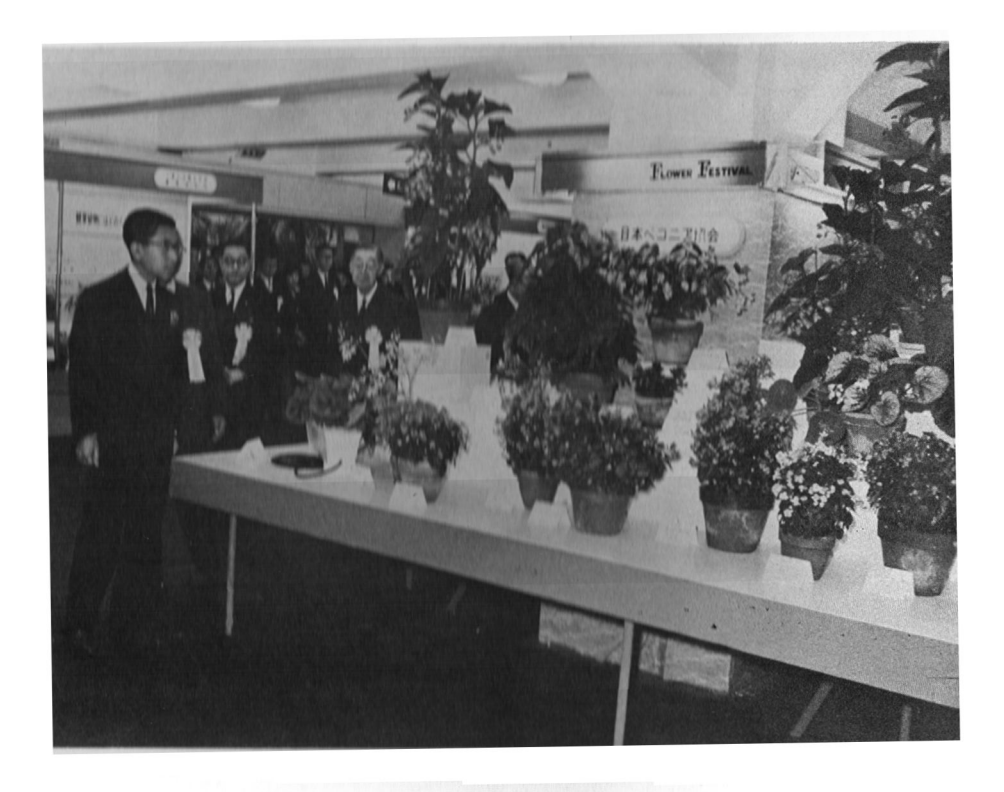
Crown Prince Akihito stops to admire display staged by Japan Begonia Society in 1964 Flower Festival.