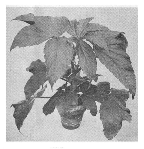
B. 'Mrs. Fred Scipps'

Like many hirsute begonias, 'Mrs. Scripps' wears her fur coat like an armor protection against drought, cool air, and other severities; so she will tolerate considerable neglect. Above all, don't overwater; rot will quickly result. Provide all possible sunlight, except in midsummer heat. If a young plant starts to grow too tall and straggly, pinch out the growing tip. Chances are, however, you won't have to perform this operation. For me, this 'Mrs.' has always willingly filled out with side branches on her own initiative.