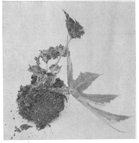
Leaf cutting of B. sunderbruchi has made ball of roots, new plant coming up from end of stem.

From upright and branching begonias — semperflorens, cane-stemmed or angel wing, hirsute or hairy-leaved, many miscellaneous plants of this erect habit — you'll take stem cuttings. The tips usually root fastest and make the nicest new plants. Take a section of stem with at least two nodes (joints). Strip off the lower leaves and any extra-large ones above. Dip the cut stem end in a hormone rooting powder, if you wish; and