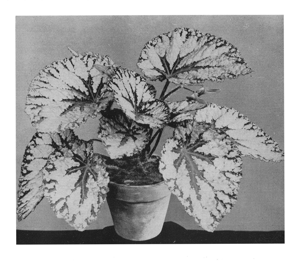
Begonia Rex of Germany