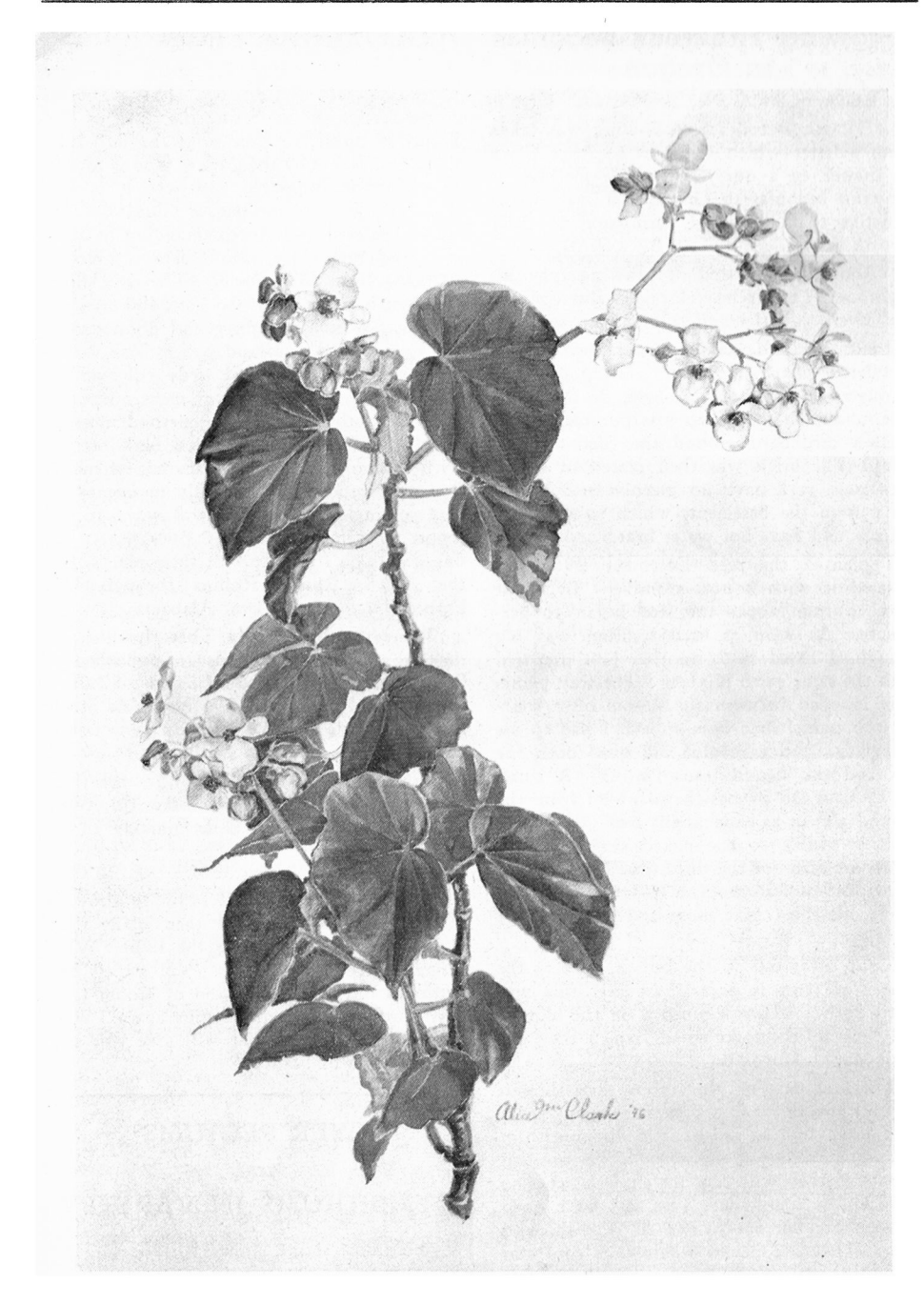
B. Nitida, var. Rosea