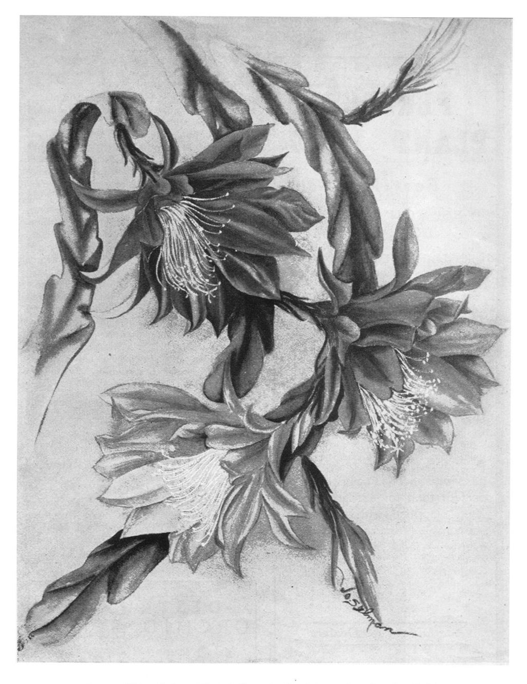
From a Water Color of Epiphyllums by Jo. Selman, Los Angeles, Calif.

around the edge of the pot. Try to pyramid the plant in the pot, so that the water does not settle around the crown, as this often rots big, strong plants. Let the water fall around the edge of the pot, keep the crown high, almost as high as the top of the pot, and you will never be troubled with rot.