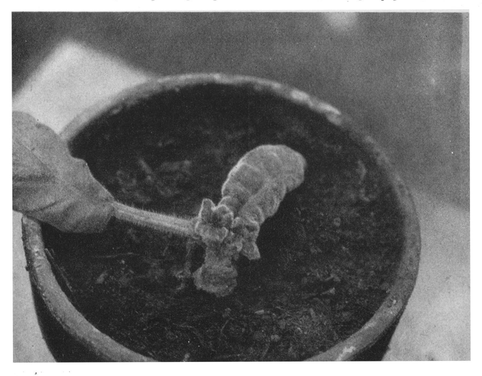
Gloxinia leaf heavily damaged by mite. Stunted and crinkled young growth.

To my knowledge, this is the first time that an easy and cheap treatment for this nematode has been found. I do not know