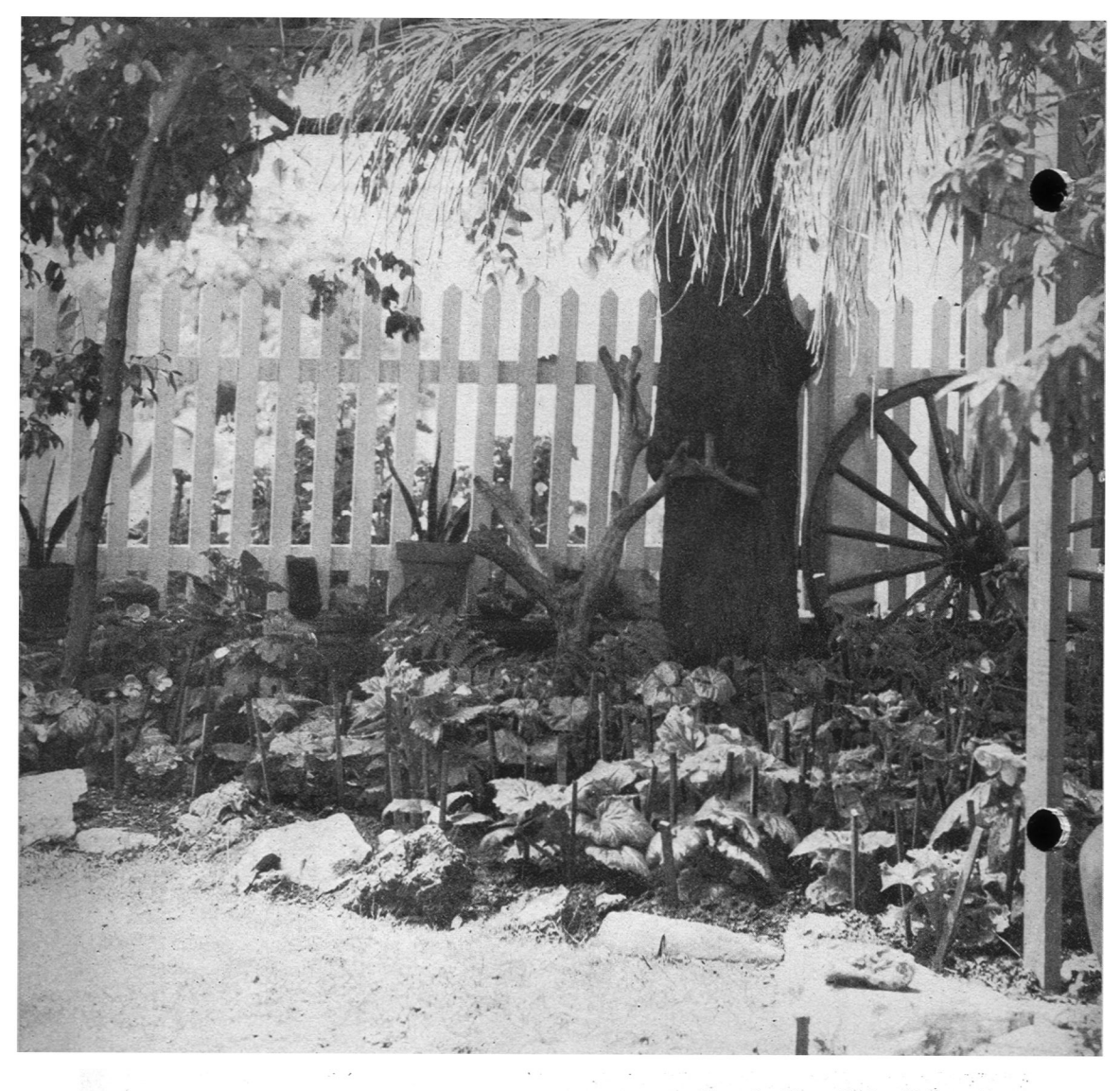
Avocado tree in back-yard showing large bed of very young tuberous begonias just about to break into first bloom. They are getting well established so that they will bloom until about November.

On right, young rosebud type tuberous begonia showing sturdy growth. Notice part of the old wagon-wheel depicting sturdiness of another kind.