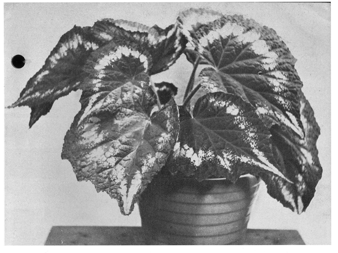
Begonia Rex Black Knight