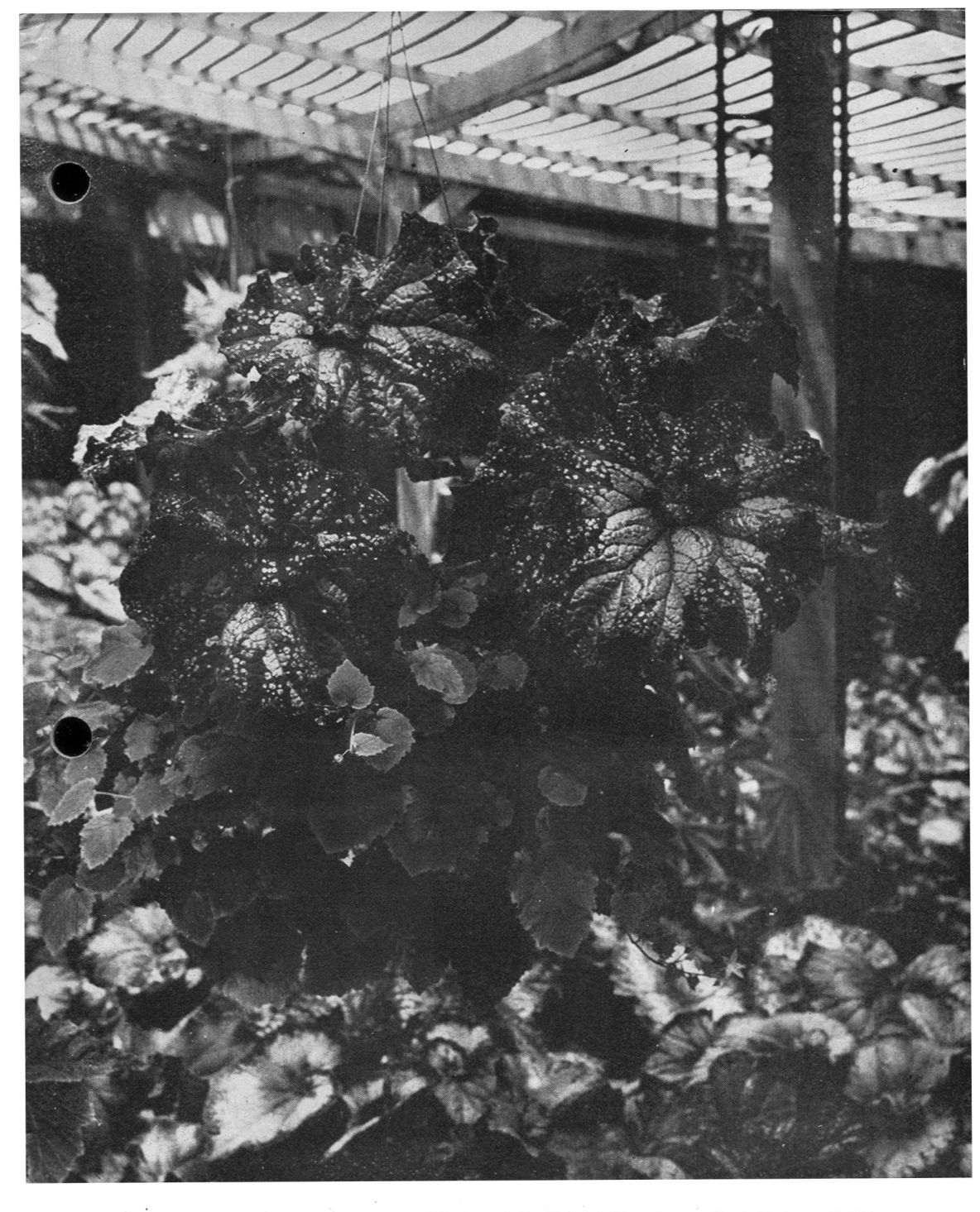
This is Ojai, the cross made during the first year of hybridizing. This year the hanging plant of Ojai measures 37 inches across, with countless, large spiralled leaves.