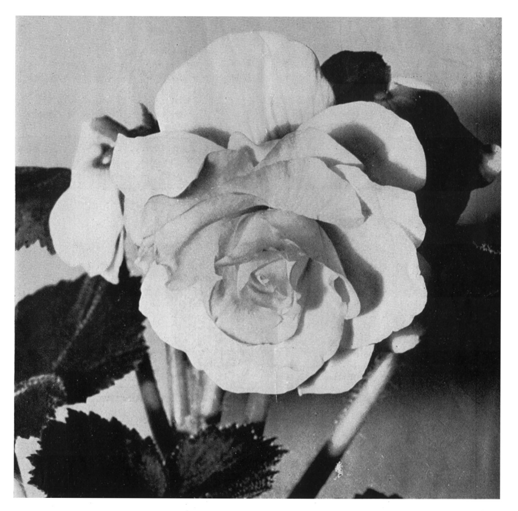
TUBEROUS BEGONIA . . . . Camellia Variety