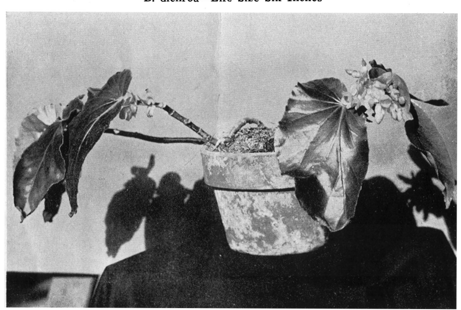
B. dichroa-Life Size Six Inches

Description: Root fibrous. Stem erect, half drooping, to two feet tall, green at tips and brown on older parts. Stipules fall off early, egg-shaped and sharply pointed. Leaf stem very short, green with a reddish tinge, not quite