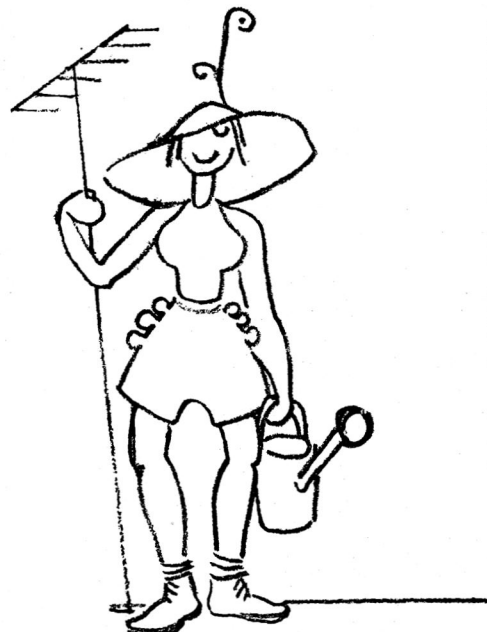
The "Little Gardener"

Begonia tubers that were started in flats or those that show signs of growth are now ready to be planted in beds or pots assuming that the beds and potting soil has already been prepared. A good soil mixture is two-thirds leaf mold, one-third well rotted dairy fertilizer and a sprinkling of steamed bone