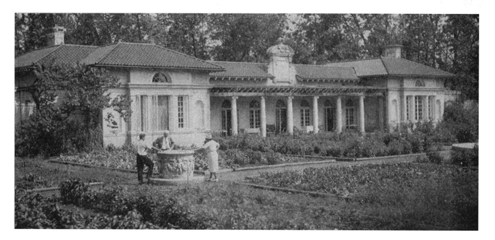
LOGEE'S ITALIAN GARDENS, Pomfret, Connecticut Where Eastern Branch met on August 26.