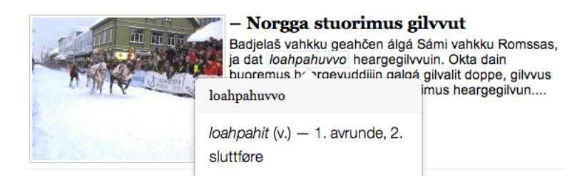
Figure 3: Reading a text with the FST-dictionary on the Saami news website site Avvir.no.

In addition to plugin for Kursa , we have produced a cross-browser solution which is similar to a browser extension, but instead, is accessible via a bookmarklet , which is a bookmark providing functionality, instead of a link to a website. As it turns out, this option has been much more preferable to developing (and also convincing users to install) browser specific plugins, and "installation" is simply a drag-and-drop affair. Thus, when on a page they wish to read, users may simply click the bookmarklet, which downloads and includes the plugin source in the HTML document structure facing the user. Now the world of news, blogs, or even Facebook, is accessible in all of the language pairs that we support.