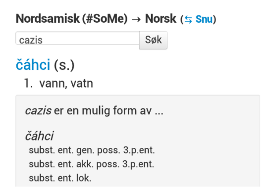
Figure 2: The FST-dictionary on the mobile.

In this case, we used Twitter Bootstrap<sup>5</sup> to get the most for less, and it has resulted in an easy to use and very minimal layout, see Figure 2. The layout works simultaneously on all the major browsers for desktop operating systems, as well as the most popular mobile browsers, see Figure 2. Thus, there is no real need to produce code specific to Apple's iOS or the Android operating system, or pay for the licensing setup involved with iOS development, and we get all of these things for free.